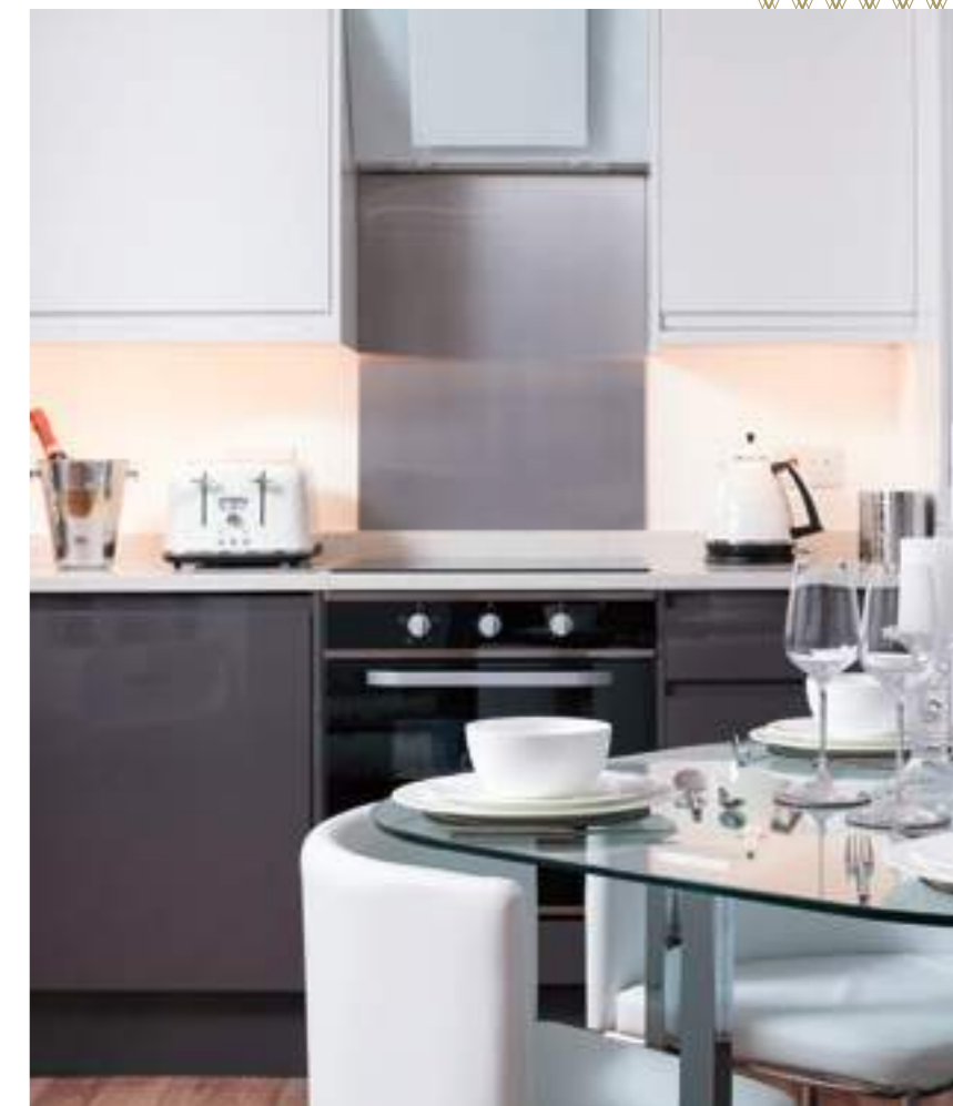
Photos are of previous Smith Homes developments.