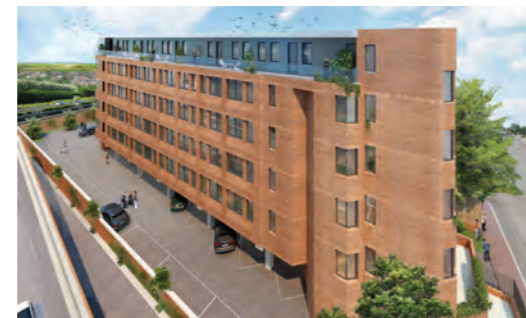
Clockwise from top left; Europe House, Hook / Bartholomew Court, Waltham Cross / Miller Heights, Maidstone / Eleanor House, Waltham Cross / Verve Apartments, Romford.