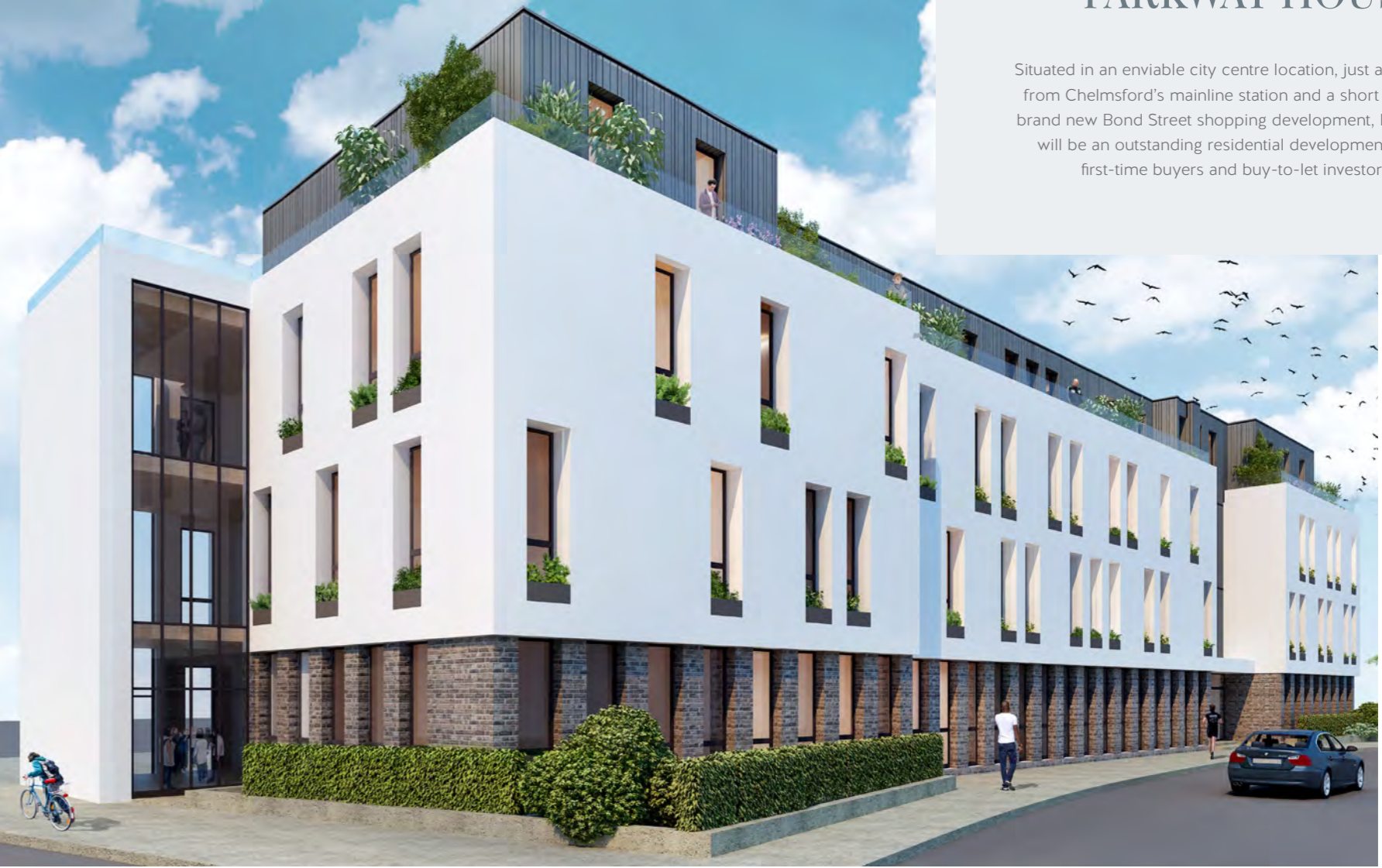
Computer generated image is indicative only.

Situated in an enviable city centre location, just a 10 minute walk from Chelmsford's mainline station and a short stroll from the brand new Bond Street shopping development, Parkway House will be an outstanding residential development; perfect for first-time buyers and buy-to-let investors alike.